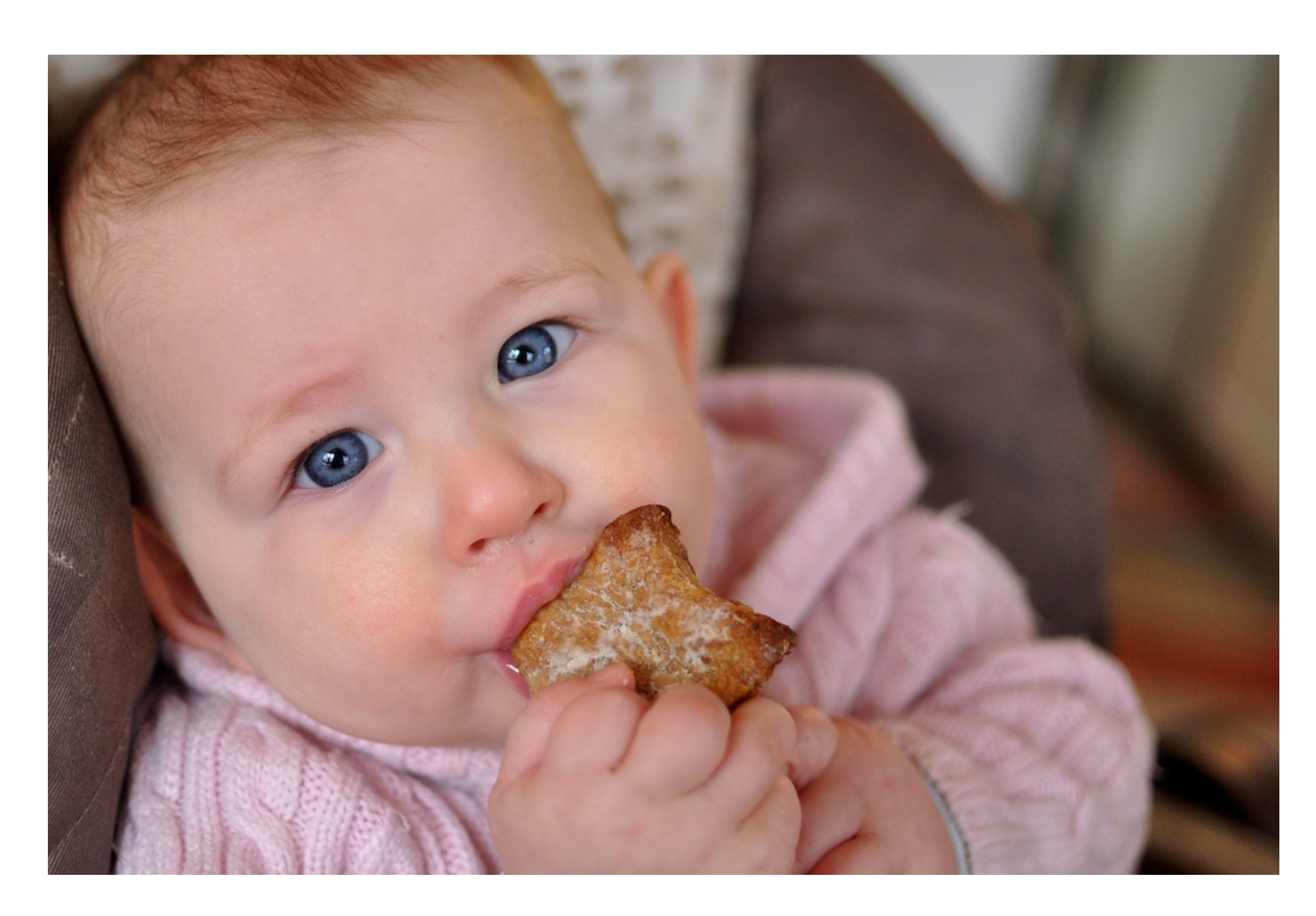
Age Start Teething Biscuits